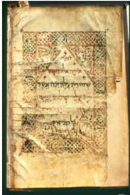
Fig. 2 L64, fol. 3r Carpet page frontpiece