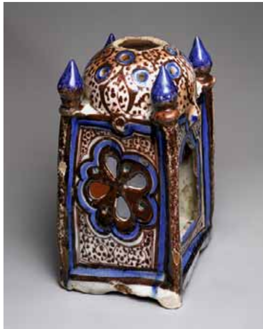
Fig. 13 Lantern