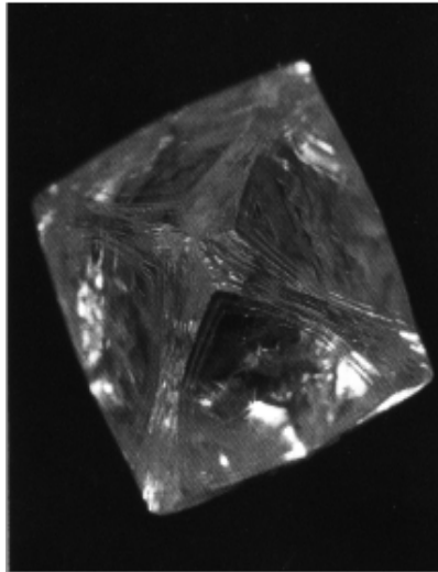
Fig. 10 The natural crystal of the diamond – octahedron shape