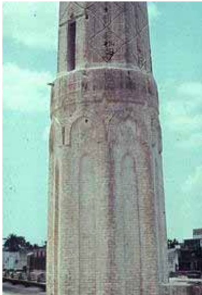
Fig. 8 The minaret of the Ayyūbī Great Mosque of Zabīd