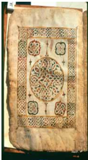
Fig. 6 L64a, fol. 108v Carpet page end piece