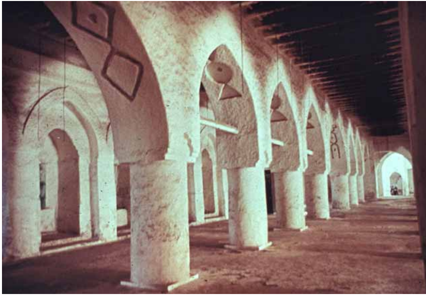
Fig. 9 The Ayyūbī Great Mosque of Zabīd