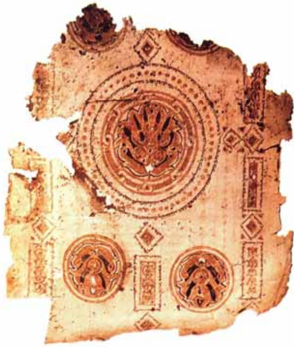
Fig. 12 Fully illuminated folio. Micrography and gold medallions